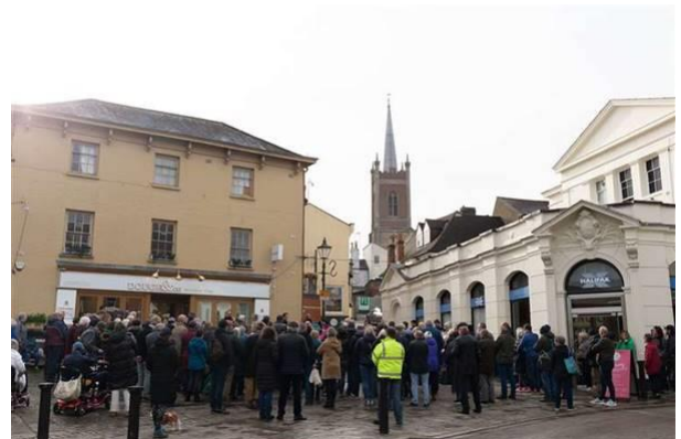
Above: Vigil for Ukraine, Bishop’s Stortford, Sunday March 13 th 2022.

Nightingales fleeing In dull, winter sky, How much farther